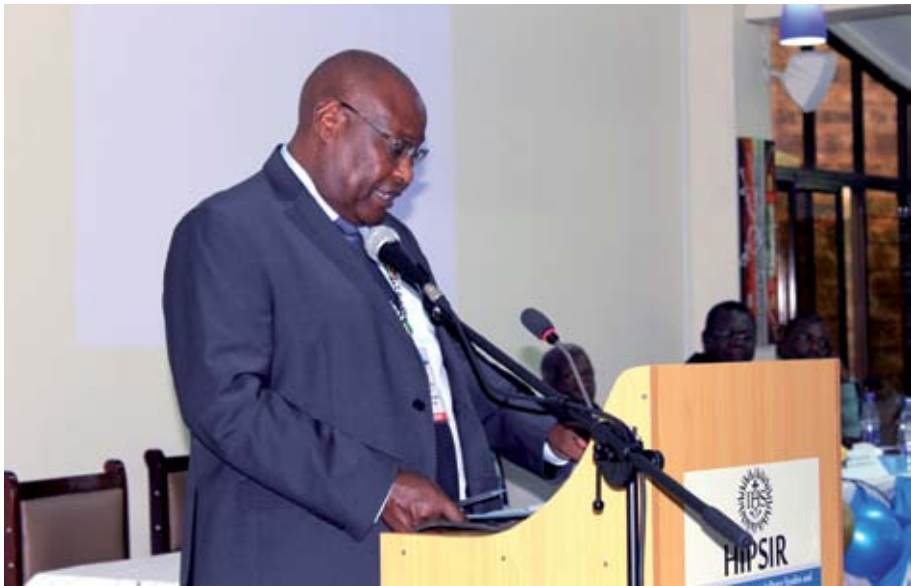
Hon. Francis Ole Kaparo , EGH, Chair, NCIC

Hon. Francis Ole Kaparo, EGH, The Commission Chairman of the National Cohesion and Integration Commission (NCIC) gave the closing remarks. He highlighted that civilized human beings should be talking about justice and equality. It means that justice is not permanent but transiting into or out of use. We are victims of disorder and therefore we need to be transiting from disorder to peaceful society. Forgiveness is necessary for those who seek it even God expects us to confess before we are forgiven our sins. Society too expects one to seek forgiveness and that it is close to impossible to reconcile in absence of admission of guilt.