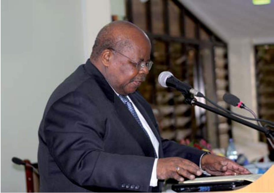
His Excellency Benjamin William Mkapa , former President of Tanzania

security and stability. For conflict resolution and peace building to take root in Africa the leaders need to identify the origins of the problem and ensure there is good governance. Lack of multilateral approaches, indifference and lack of political will among leaders have hampered the achievement of peace building and reconciliation.